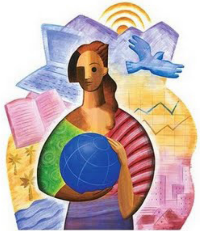
Art as Advocacy: Civil Society in Action

In addition, the Ronahee Organization for Social and Cultural Activity is partnering with the Art Institute of Kurdistan to paint more than 100 murals supporting civil society law reform throughout the Kurdistan region, including along the road approaching the Kurdish Parliament.