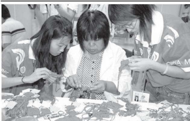
Two volunteers learn the skill of making handicrafts from a handicapped person at the Warm Family of Xicheng District Handicapped Association, the Beijing 2008 Paralympic Games volunteers training base, in Beijing, capital of China, on 22 Aug, 2008.