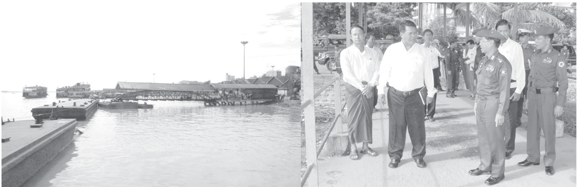
Lt-Gen Myint Swe inspects jetties which have been repaired in Yangon River.