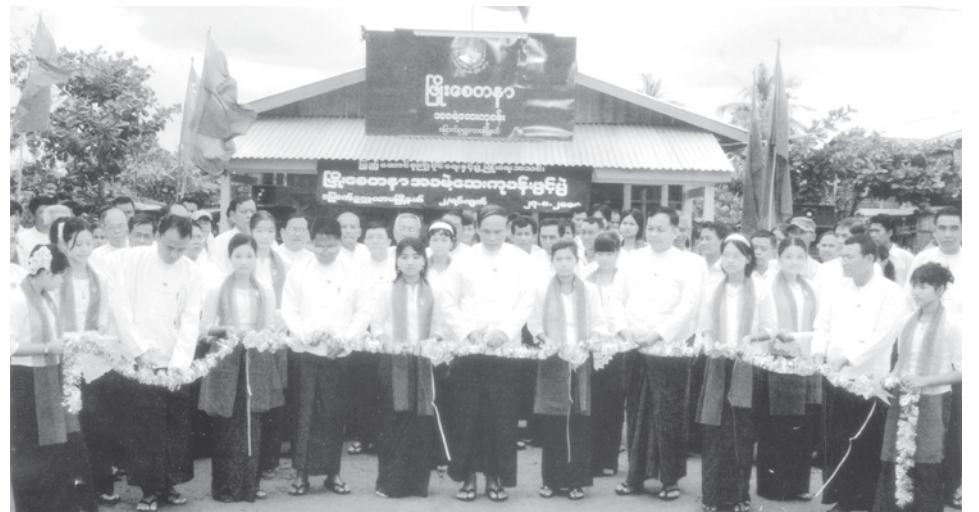
Mayor Brig-Gen Aung Thein Lin, Vice-Mayor Col Maung Pa and officials open Phyto free clinic in North Okkalapa.

NAY PYI TAW, 28 Aug—According to the 11.30hr MST observation today of the Department of Metrology and Hydrology, the water level of Sittoung River at Madauk is 1078 cm and it has exceeded by 8 cm (about 3 inches) above its danger level. It is forecast to fall below its danger level 1070 cm during the next 24 hours.—MNA