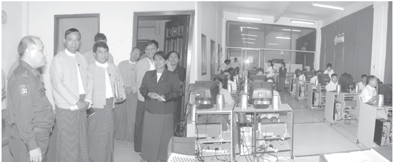
Deputy Minister for Finance and Revenue Col Hla Thein Swe inspects Clerical Refresher Course No. (1/2008) and Basic Computer Course No. (1/2008).—MNA

He also inspected Clerical Refresher Course No. (1/2008) and Basic Computer Course No. (1/2008) being conducted at the training hall and computer training hall of the department and left necessary instructions.—MNA