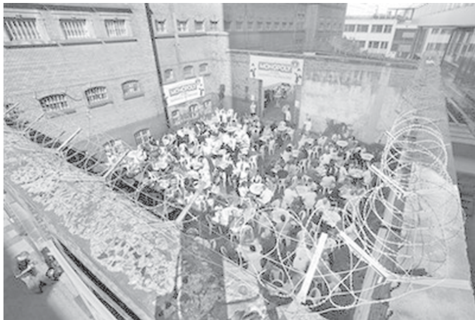
People play Monopoly in a former prison yard in Frankfurt, Germany, on 27 Aug, 2008, as they join thousands of people playing the board game worldwide at the same time to break a Guinness world record.