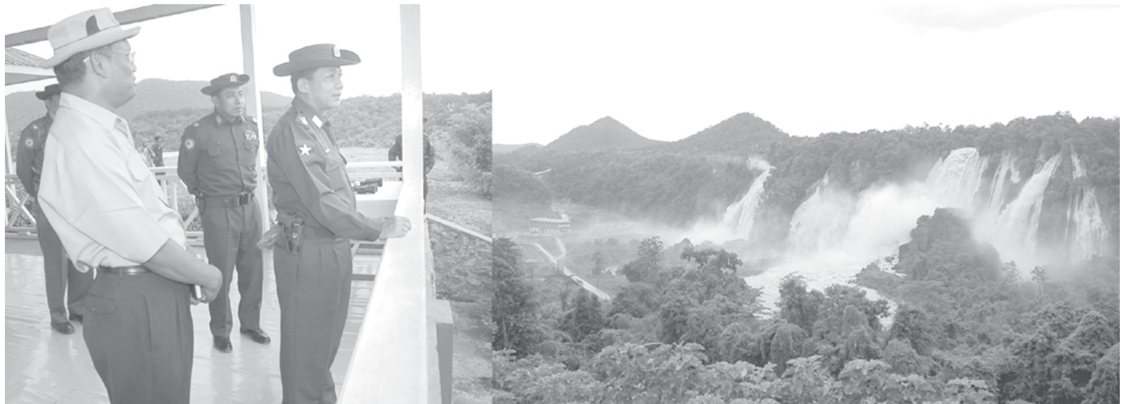
Maj-Gen Min Aung Hlaing inspects Kengtawng Hydropower Project in Kengtawng Township.—MNA

After viewing thriving 10-acre sugarcane plantation, they met departmental officials, members of social organiza-