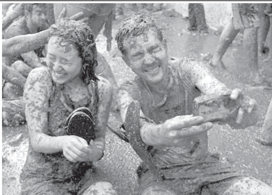
Revellers pose in tomato pulp during the annual "Tomatina" (tomato fight) in the Mediterranean village of Bunol, near Valencia, on 27 Aug, 2008.

Ecuador and Venezuela, which have close cooperation in economy, oil and culture, are the only two Latin American countries that are part of the Organization of Petroleum Exporting Countries (OPEC).— Xinhua