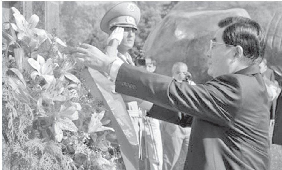
Visiting Chinese President Hu Jintao presents a wreath to the monument to the ethnic pacification and recovery in Dushanbe, capital of Tajikistan, on 27 Aug, 2008.