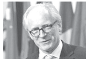
Mr Kai Eide, Special Representative of the Secretary-General for Afghanistan.

“The destruction from aerial bombardment was clearly evident with some 7-8 houses having been totally destroyed and serious damage to many others. Local residents were able to confirm the number of casualties, including