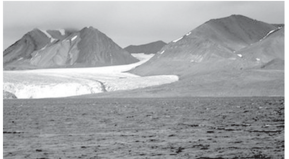
File photo shows a glacier seen from the Ice Fjord on the Norwegian Arctic archipelago of Svalbard. The Arctic ice cap keeps melting under the effects of global warming and in August saw its second largest summer shrinkage since satellite observations began 30 years ago, US scientists said.