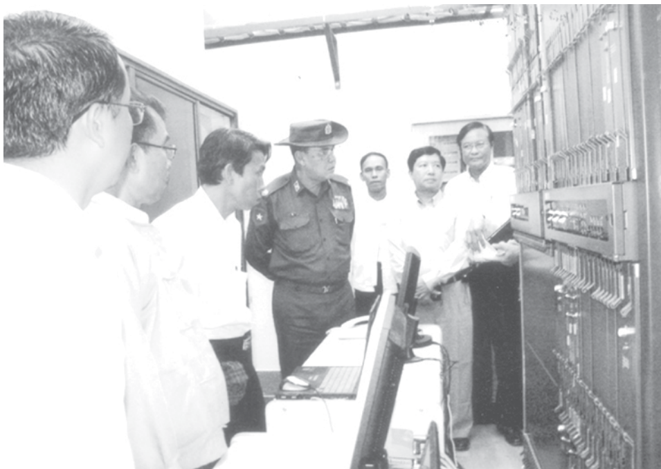
Brig-Gen Thein Zaw inspects digital auto-exchange in Magway. COMMUNICATIONS