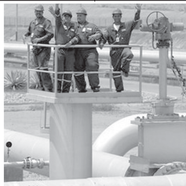
File photo shows state-owned Petroleos de Venezuela oil company workers at the Jose Antonio Anzuategui industrial complex. Venezuela has raked in 4.3 billion dollars from a tax on windfall oil profits it started collecting from Petroleos de Venezuela in mid-April, President Hugo Chavez said.