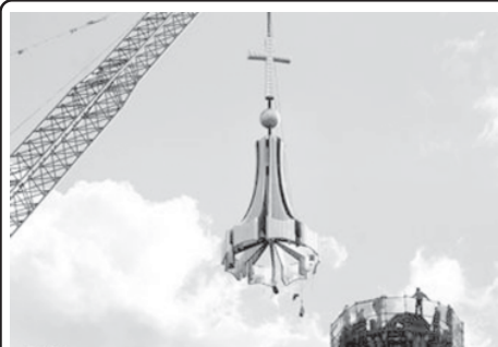
Berlin Cathedral has been given back its golden cross. The cross, which was taken down for restoration in Dec 2006 was finally replaced on the morning of Tuesday, on 19 Aug. The total costs for the maintenance and restoration reached 1.42 million euros ($2.08 million) and the cross alone cost 700,000 euros -- that may be unsurprising given that around 1.5 kilogrammes (3 lb 5 oz) of gold leaf was applied to it. Together with its base the cross is 15 metres high (49 feet) and weighs two tons.