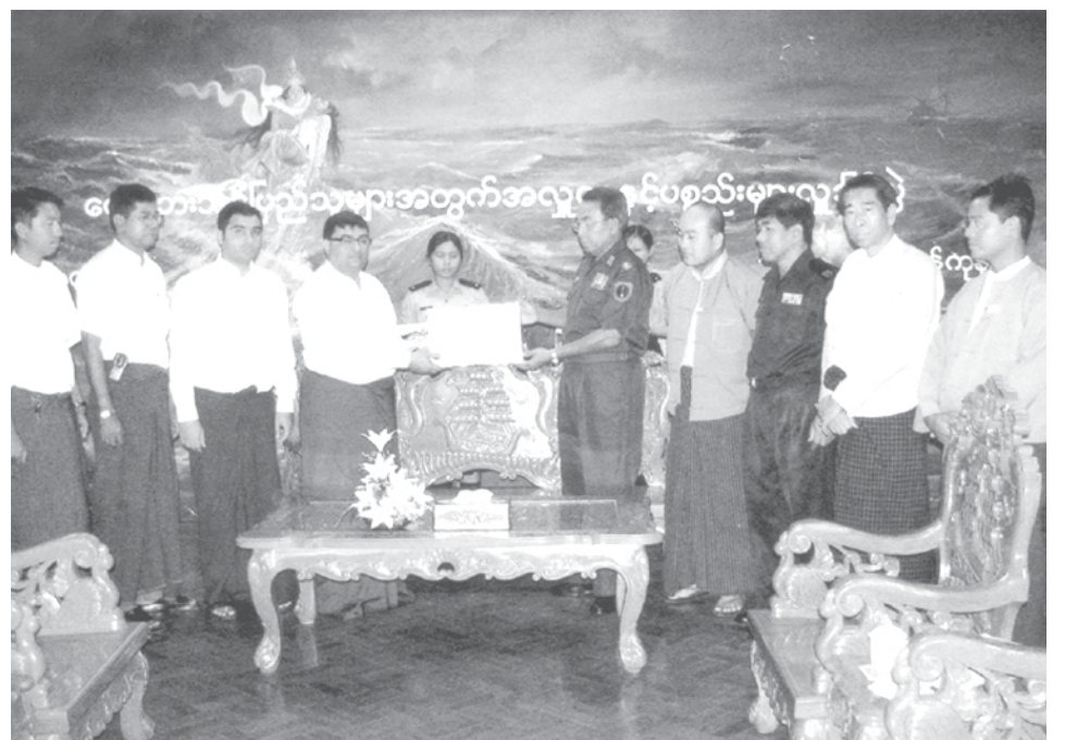
Deputy Minister Brig-Gen Kyaw Myint accepts 50 bags of fertilizer worth K 1.1 million donated to storm survivors by Chairman U Thant Zin and Director U Soe Moe Naing of Thazin Naing Trading Co Ltd

On arrival at No.1 fertilizer plant (Sale) in Magway Division, the minister heard reports on arrangements for running the plant at full capacity presented by U Aung Din, expert of Myanmar Petrochemical Enterprise. The minister called for exceeding the set production target and looked into manufacturing of Urea fertilizer.—MNA