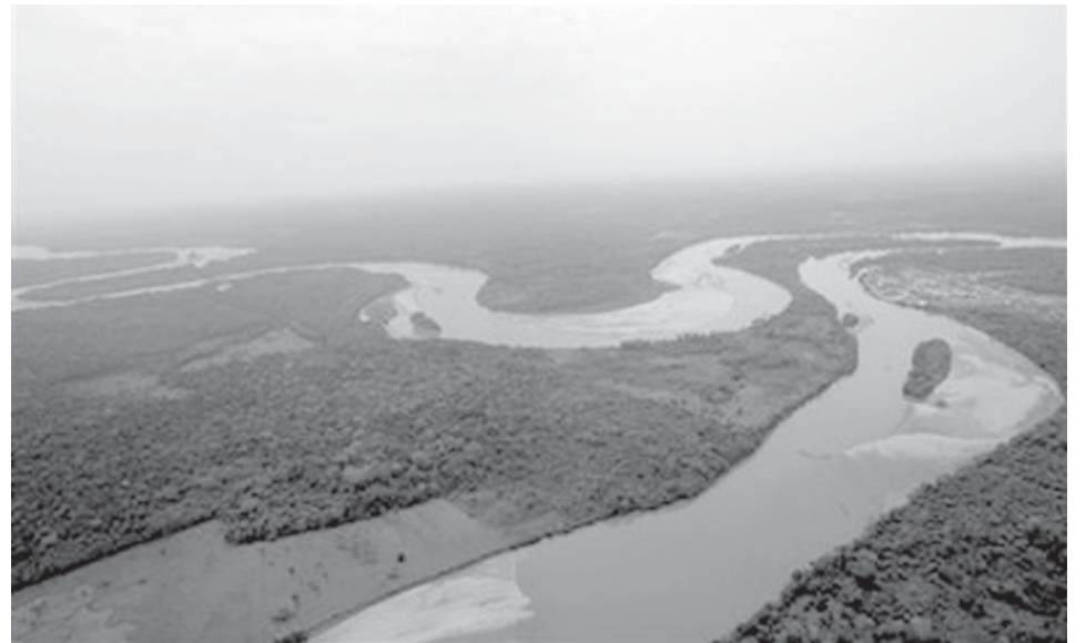
An aerial view of the San Miguel river at an Amazonian region of Ecuador, on the border with Colombia, is seen from a helicopter on 26 Aug, 2008. Ecuador will run next September a programme named ‘Plan Ecuador’, to formally shelter around 50,000 Colombian citizens who live along in settlements along the border with Colombia.—INTERNET

Sony invested $106 million in the Singapore plant, which will produce 8 million battery units a month for mobile phones by 2010 and employ 500 workers. Rechargeable lithium-ion batteries, now common in cell phones and laptops, produce more power and are smaller than nickel-metal hydride batteries.—Internet