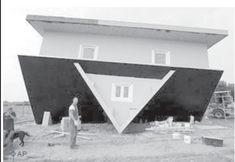
An entire house standing up side down is seen in Trassenheide, northern Germany. The house was built to enable a new perspective on everyday life for visitors.