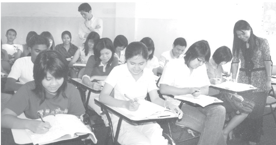
Trainees in classroom of Sky Home Language Center.—MNA

All courses will commence from 1 September, and 15 students will be accepted at a classroom. The Headmasters and teachers of the training school from Japan will conduct the exam test and interview for the students at Sky Home in Yangon. Interested students may sit for the exams. Those wishing to sit for the exam may enlist in advance.—MNA