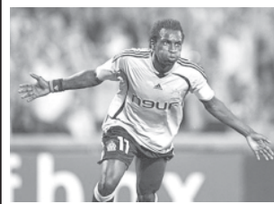
Marseille's forward Mamadou Niang celebrates after scoring the second goal of the game at the Velodrome stadium in Marseille, southern France, during the third qualifying round of the European Champions League's football match Marseille/Brann Bergen. Marseille won 2-1.

MARSEILLE (France), 28 Aug — French first division front-runners Marseille muddled into the Champions League proper here on Wednesday after an unconvincing 2-1 home