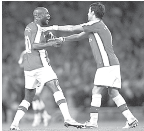
Arsenal's French Defender William Gallas (left) celebrates scoring with teammate Spanish Midfielder Cesc Fabregas during their third round, 2nd leg, UEFA Champions League qualifier match against FC Twente at the Emirates Stadium, London. Arsenal won 4-0.

LONDON, 28 Aug — Arsene Wenger believes the return of Cesc Fabregas in Arsenal's 4-0 Champions League rout of FC Twente signals the real start of his side's season.