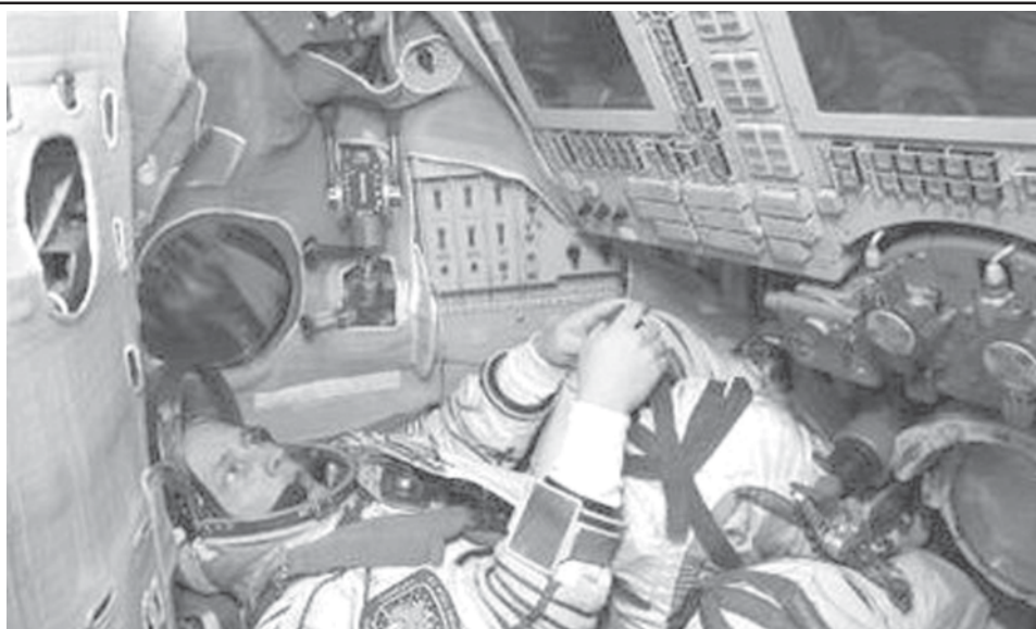
US astronaut Michael Fincke attends a training session in a space capsule in the Star City space centre outside Moscow on 27 August, 2008. Fincke is scheduled to visit the International Space Station (ISS) in October as part of the 18th ISS crew.