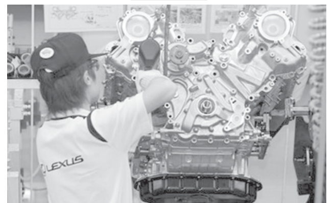
A worker on the production line of Japan’s auto giant Toyota assembles an engine for the vehicle manufacturer’s Lexus car range.—INTERNET