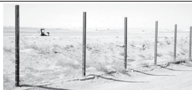
The border fence between Egypt and Israel. Egyptian authorities have arrested 33 African migrants, including four children, who were trying to cross the border illegally into Israel, a security official has said.