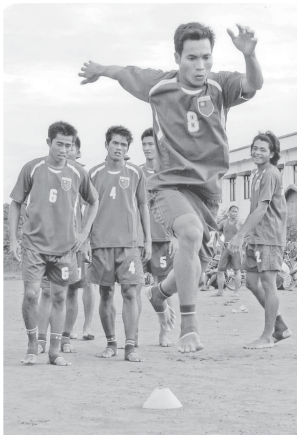
Myanmar players seen in a training session.

has been camped since the last week of July for Merdeka Cup Beach Soccer Tournament. Nineteen tentatively-selected footballers were called in, but two of them failed to appear. So, training sessions are being held with 17 players. The training ground is under