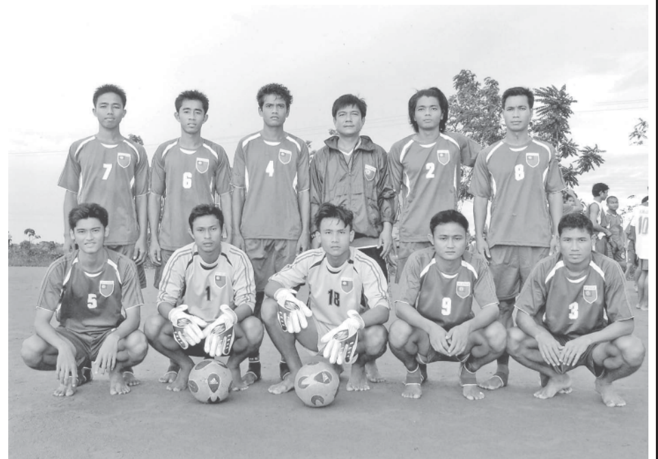
The selected Myanmar team in the training ground.

Translation: MS Myanma Alin: 25-8-2008 *****