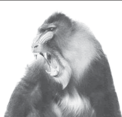
The male mandrill ( Mandrillus sphinx ) or man-ape of equatorial West Africa has an average head and body length of 61–76 cm (24-30 in) and a tail length of 5.2–7.6 cm (2-3 in). Adult males weigh an average of 25 kg (55 lb), although specimens weighting up to 54 kg (119 lb) and measuring 50.8 cm (20 in) to the shoulder have been known. The mandrill is also one of the most colourful mammals, recognized by its naked vivid-blue rump, red-striped face and yellow beard.

The boy was treated for a small cut to the head then taken to Nueces County Juvenile Justice Centre, where he