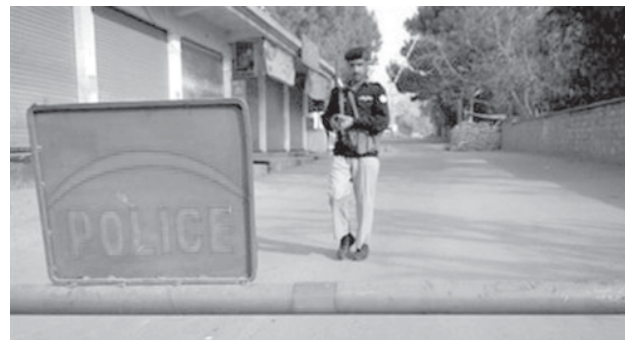
A Pakistani policeman stands in front of a police barrier in northwestern Swat valley. At least 10 people, including police officers and prison staff, died in a suicide attack on Thursday in a garrison town in northwest Pakistan as they headed to work, a police official told AFP.

BANNU, 28 Aug — At least 10 people, including police officers and prison staff, died in a suicide attack on Thursday in a garrison town in northwest Pakistan as they headed to work, a police official told AFP.