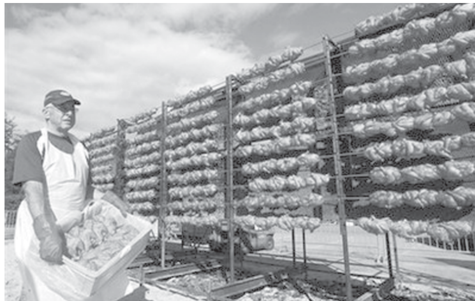
A barbecue worker carries a box of barbecue chicken, in preparation of the 'Fete du poulet' the chicken barbecue festival, on 23 Aug, 2008 in Sierre, Switzerland. The organizing committee is trying to break the world record in grilling chicken that was established in Stans, Switzerland, in July this year. On the giant barbecue grill 610 chicken can be grilled at the same time and the cooks are trying to grill a total of 2,500 chicken.

Witnesses and police said the victims' van lost control and crossed the highway's right lane to the left and crashed on the wall.