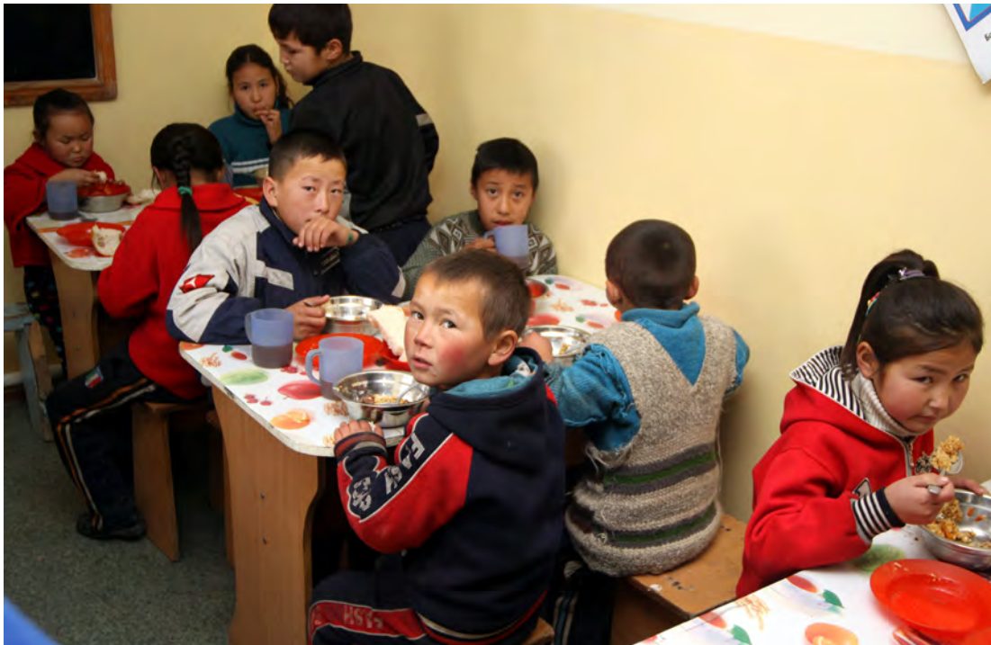
Children receiving a hot meal at the Children’s Protection Center.