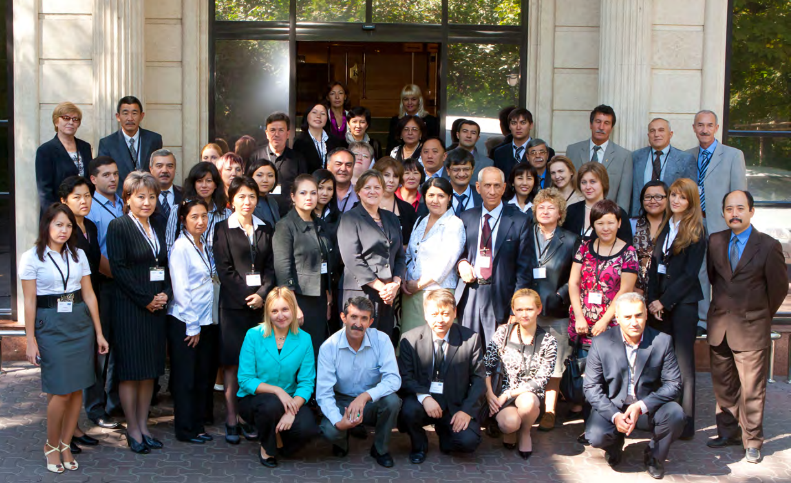
Regional meeting of civil society legal experts in Central Asia.