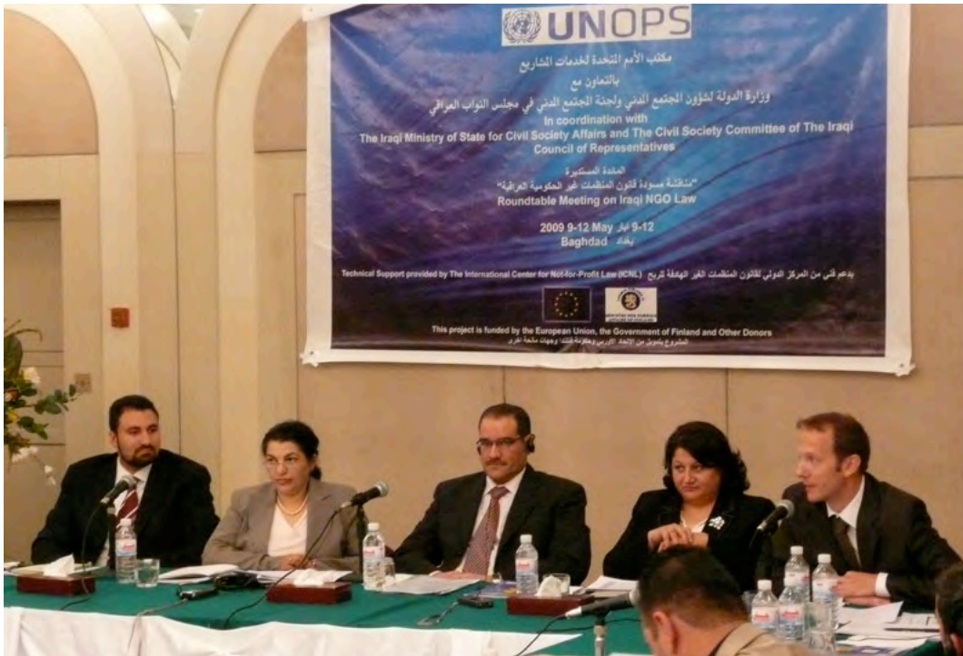
An ICNL/UN Roundtable Conference on the Iraqi NGO Law, held in May 2009.

ICNL collaborated with the United Nations Office of Project Services – Iraq Operations Centre to support the work of Iraqi local partners by convening roundtable workshops that brought together government officials, Members of Parliament, and civil society leaders. ICNL also provided support to advocacy campaigns launched by more than a dozen Iraqi NGOs, including the filming of a documentary on NGO law, the broadcast of dozens of radio and television programs educating the public on civil society law, and an exhibition of paintings by students from the Art Institute of Kurdistan on themes related to civil society law.