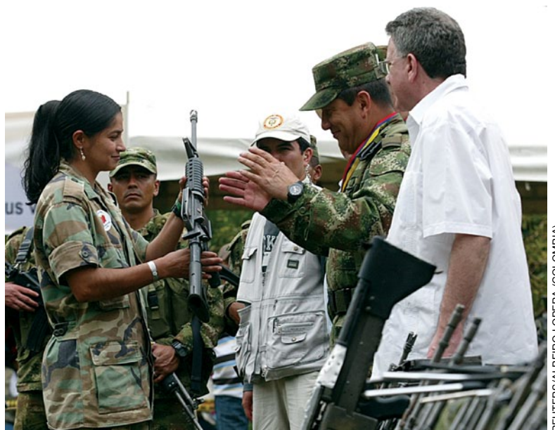
Colombian rebels of the ERG surrender their weapons in El Carmen de Atrato Choco Province, 21 August 2008.

Members of the Colombian armed forces have been investigated recently for killing unarmed civilians and covering up the crimes by claiming that the deceased were guerillas killed in a firefight. The civilian intelligence service was shut down in September 2010 for colluding with paramilitaries in spying on judges, opposition politicians, journalists, and human rights defenders. More than eighty members of the Colombian Congress, many of them members of the ruling coalition, have been jailed or placed under investigation for ties with paramilitary groups. 36