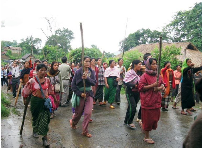
Gwaltabi, Manipur. On 7 September 2009 security troops ambushed a pickup truck and executed five passengers. “Rebels” according to the army, “civilians” according to the demonstrators. Out of protest these women blockade the road the army frequently uses.

Latin America, and Africa and is based on interviews and meetings with hundreds of representatives of civil society organizations (CSOs), donor agencies, research centers, and governments. It benefits especially from the work of CIVICUS, the International Center for Not-for-Profit Law, and the Charity and Security Network. The purpose of the report is to examine the impact of CTMs on local development and human rights activities and to identify appropriate government, intergovernmental, and nongovernmental responses.