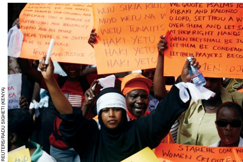
Women raise their hands and shout slogans during a march for peace in Nairobi, 10 January 2008.

Civil society groups played an important role in facilitating and encouraging the post-election settlement mediated by former UN Secretary-General Kofi Annan in 2008 in which Kibaki and Odinga agreed to rule