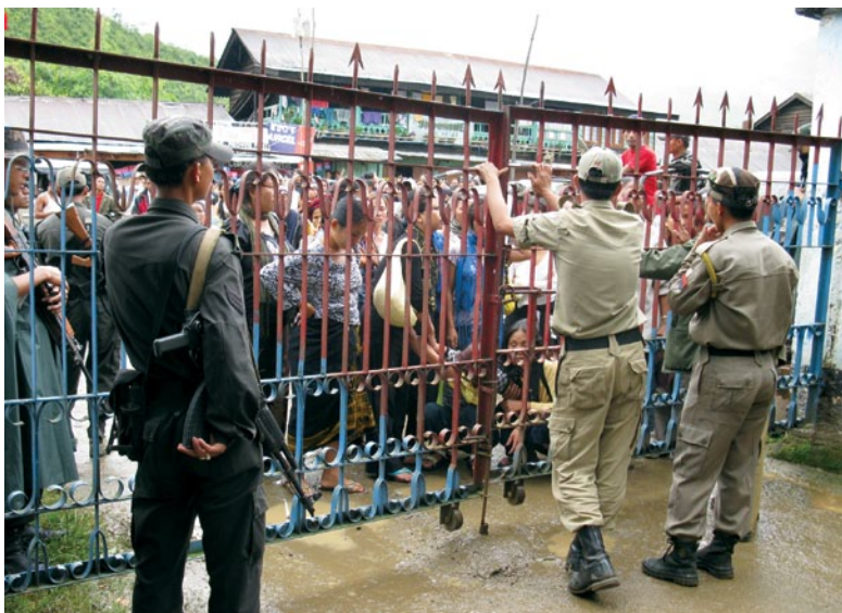
Women's protest against excessive army violence in Imphal, Manipur.

incidents of unlawful arrest, torture, and extrajudicial killing.