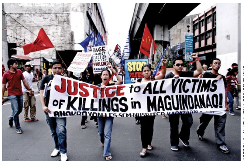
Youth Protest Against Ampatuan Massacre, 26 November 2009.

In 2010 Mindanao Peaceweavers published a Mindanao Peoples' Peace Agenda, based on dialogue and consultations with multiple local constituencies. 59 The document offers policy suggestions and serves as a roadmap for overcoming violence, injustice, and oppression in the region. It affirms the right of self-determination and highlights the need for human rights,